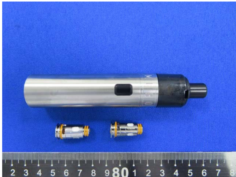
GEEKVAPE MERO AIO KIT 2ML with 0.4ohm KA1/0.6ohm KA1