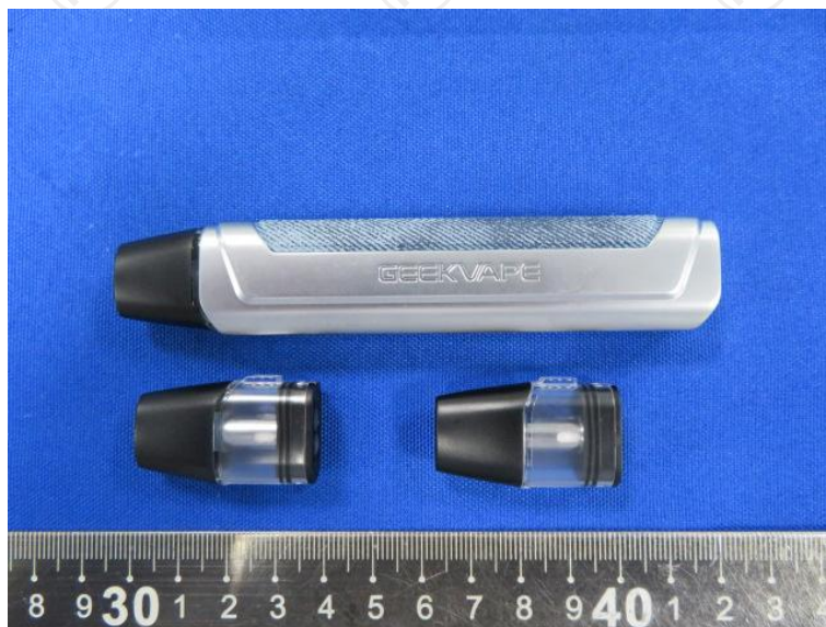
Geekvape One kit 0.8ohm FeCrAl (12-16W) /1.2ohm FeCrAl (8-12W)