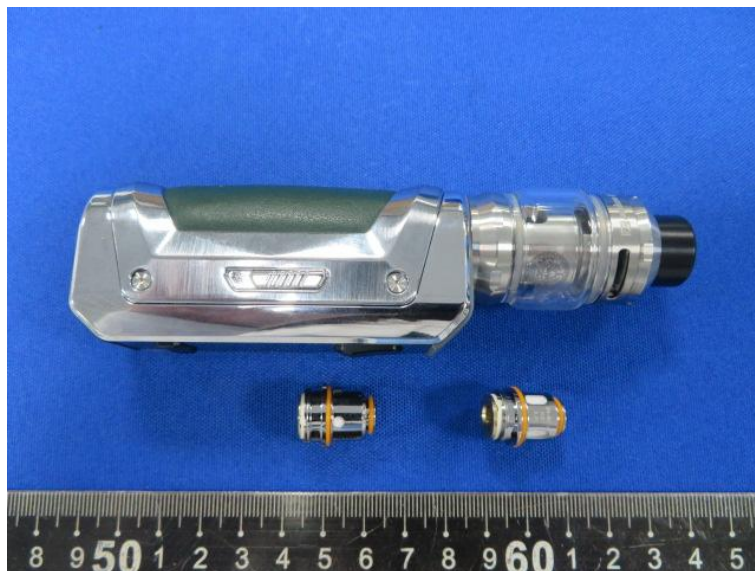
Geekvape S100 KIT (Aegis Solo 2 Kit) with 0.25ohm(45-57W)/0.2ohm(70-80W)