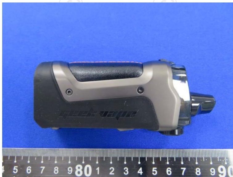
GEEKVAPE AEGIS BOOST PLUS KIT 2ML