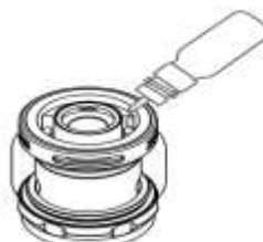
Fill with liquid