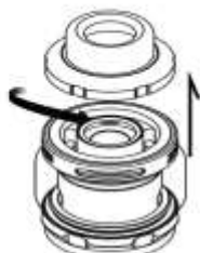
Twist to open top cap