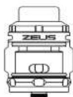
Get the product