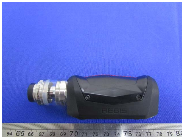
GEEKVAPE AEGIS MINI KIT 2ML