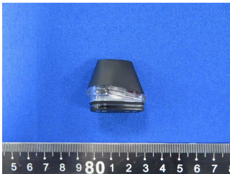
AEGIS NANO POD 1.2